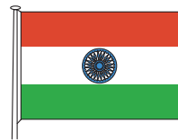
Zaskar River - India August