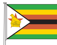
Zambezi River - Zimbabwe September to November