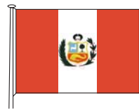
Colca Canyon - Peru June through July